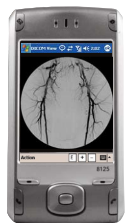
Dye Contrast CINE Loop

mVisum offers customizable integration solutions that allow delivery of high quality images and other data from your RIS/HIS System directly to a physicians smartphone. Once delivered, physicians can immediately review and respond to patient data using mVisum's proprietary technology. A “stat” read has a whole new meaning with our integrated solutions.