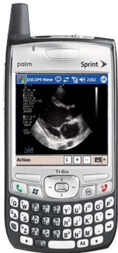
Full Motion Ultrasound